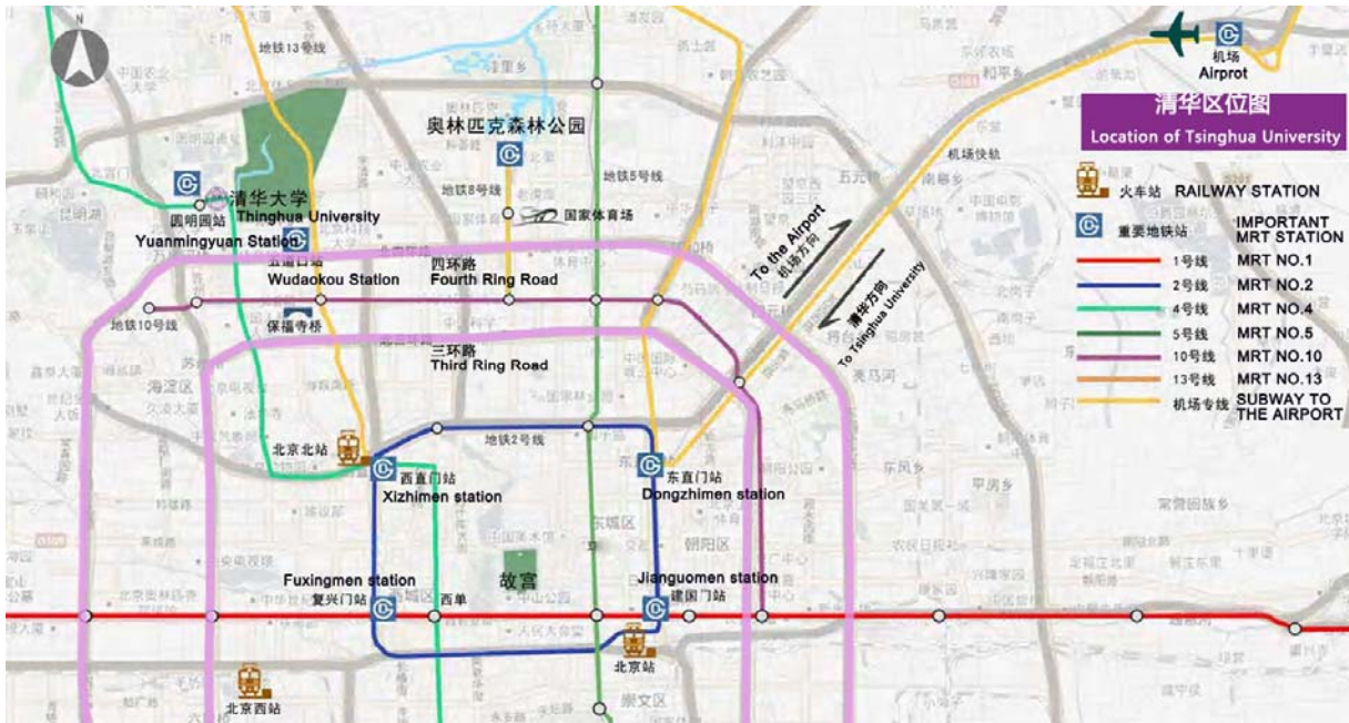
Location Map of Tsinghua University at Beijing

It is much easier to take TAXI from Beijing International Airport to the Hotel. The distance is about 35 KM and the price is about RMB 100-150 Yuan plus airport highway toll, which depends on the traffic. Please show the Chinese information and map to Taxi driver. The most possible route is as follows: Airport—Airport Highway—The Fourth Ring Road—East Zhongguancun Road—Hotel.